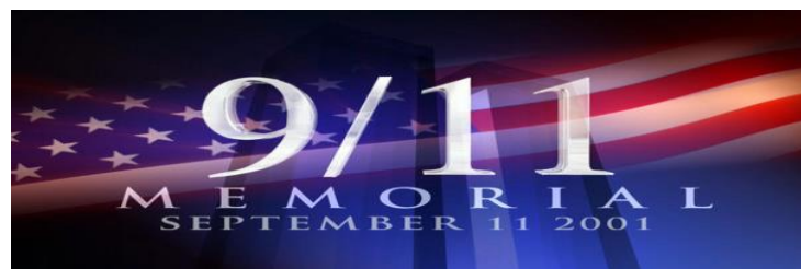
22 nd Anniversary