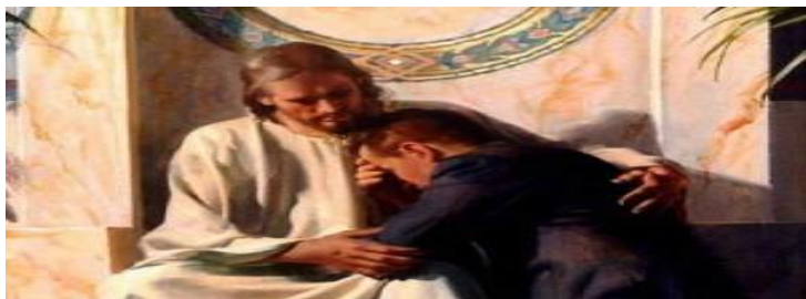
"I say to you, forgive not seven times, but seventy-seven times."